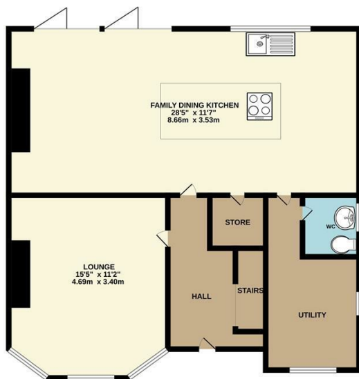
GROUND FLOOR 568 sq.ft. (52.7 sq.m.) approx.